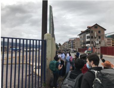
People wait at the airport at Cusco

“There were actually situations that we saw on Facebook where the mother [would get]